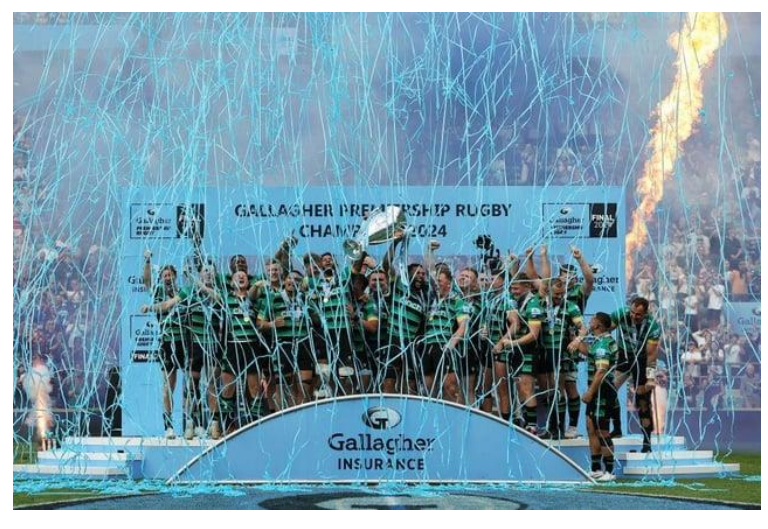
The Northampton Saints Premiership Champions 2023/2024

On a sporting front the town has a football, rugby and cricket team. The football team "The Cobblers" play at Sixfields Stadium in Division 1. The rugby team, Northampton Saints, play at Franklins Gardens in the Gallagher Premiership and won the title for the second time in 2024. The cricket team were promoted to Division 1 of the County Championship in 2019.