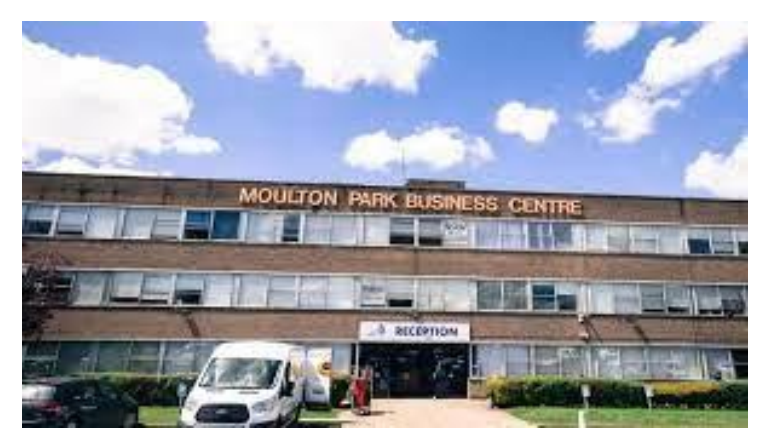
Moulton Park Business Centre – the course location

If you have any questions or require any further information about anything in this guide then please send an email to: training@sierra.co.uk