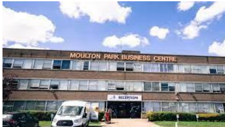
Moulton Park Business Centre – the course location

If you have any questions or require any further information about anything in this guide then please send an email to: training@sierra.co.uk