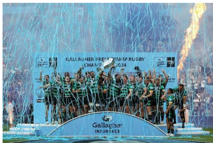
The Northampton Saints Premiership Champions 2023/2024

On a sporting front the town has a football, rugby and cricket team. The football team "The Cobblers" play at Sixfields Stadium in Division 1. The rugby team, Northampton Saints, play at Franklins Gardens in the Gallagher Premiership and won the title for the second time in 2024. The cricket team were promoted to Division 1 of the County Championship in 2019.